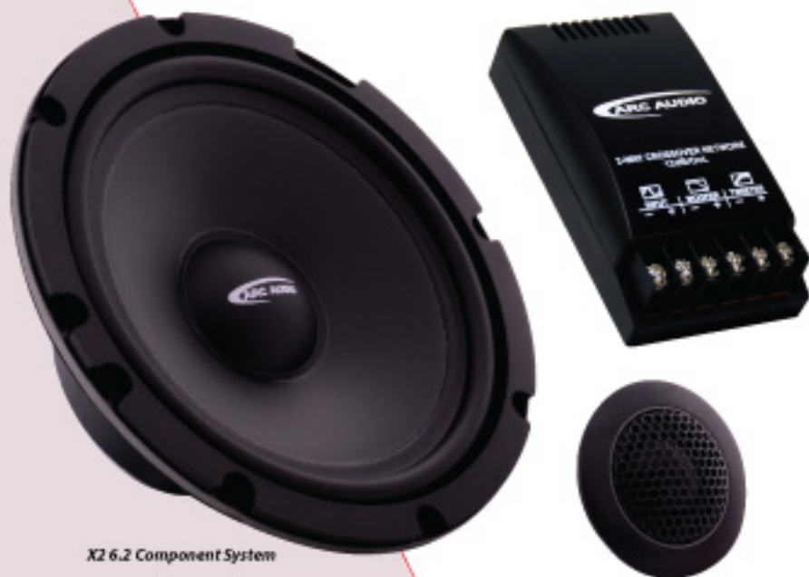
X2 6.2 Component System

Component Speakers Coaxial Speakers OEM Fit Drivers