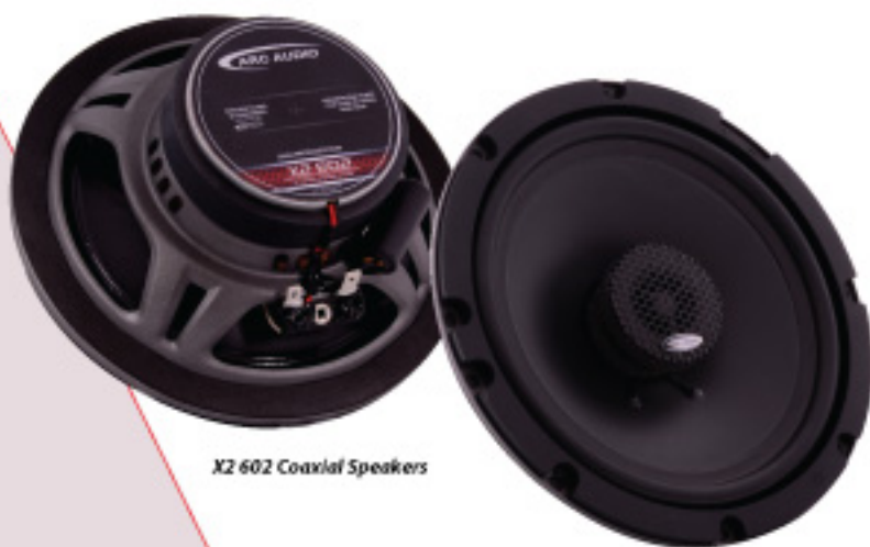
X2 602 Coaxial Speakers

To ensure reliability and long-term performance of every product in the new X2 speaker line, ARC Audio implemented enhanced testing procedures with the ultimate goal of finding and analyzing the failure points of each individual model to improve the overall design individually extending the life of the speaker in a wider range of applications. All of the X2 speakers were tested for power handling using 8 hours of playback using the RS-426A modified pink noise test signal program. After this power test completes successfully, the process was enhanced by doubling the power level after each successful test until we found the true musical failure point of each driver. This process confirms our intention of delivering an extremely durable and thermally reliable speaker designs that offers exceptional long-term performance. Consumers